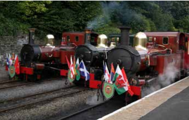
A pride of 'Peacocks'