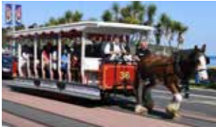
Douglas Bay Horse Tramway since 1876