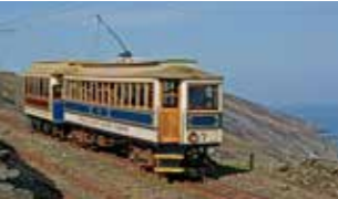
The Manx Electric Railway since 1893