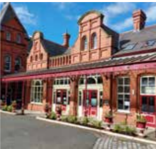
Douglas Railway Station

His Grace, George Granville William Sutherland-Leveson-Gower, 3rd Duke of Sutherland was instrumental in the establishment and financing of the Isle of Man Railway Company and served on the board of Railway Chairman from 1872 until 1879. The Clan Sutherland family origins can be traced back many centuries in Scotland and the historic family seat is the majestic Dunrobin Castle, a mile north of Golspie. The castle was remodelled by Sir Charles Barry for the 2nd Duke of Sutherland between 1835 and 1850.