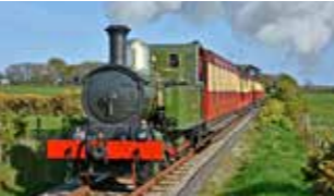
Isle of Man Railway since 1873