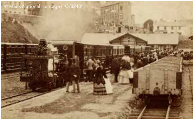
Opening day for the Isle of Man Railway 1st July 1873