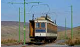
The Snaefell Mountain Railway since 1895