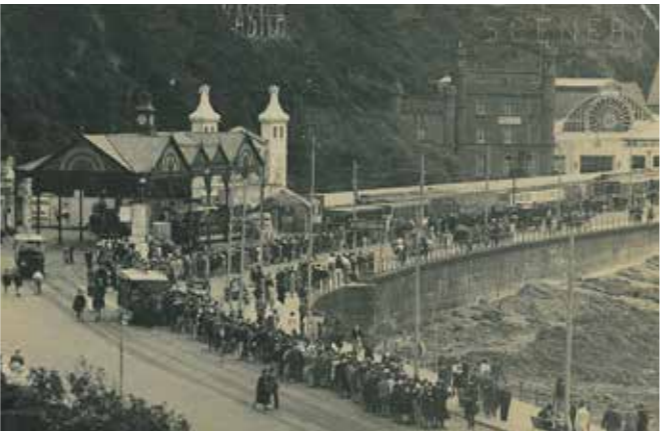
Derby Castle Station on a busy summers day c.1910

Standard tram fares apply. Go travel cards accepted.