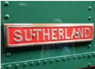
Name plate of No.1 ‘Sutherland’

We are grateful to The Manx Steam and Model Engineering Club operating one of their miniature locos on railway track panels built by school children of the Isle of Man over the last 10 years during educational visits by the Railways team into schools. Why not take the opportunity to see if you can find the sleeper you signed if you took part in one of the workshops when you were at primary school! Also on display the 1921 ‘Fowler’ Highway Board Road Roller.