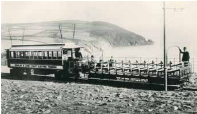
Test runs of the M.E.R in August 1893 using Car No.3 & Trailer No.16