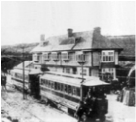
Groudle Glen 1893

Festivities today will commence with a parallel run between Derby Castle and Groudle Glen the line's original 1893 terminus point. G.F Milnes Unvestibuled Saloon Cars No.1 and No.2 from 1893 will be used for the occasion. Departs Derby Castle 08:50, returns by 09:30.